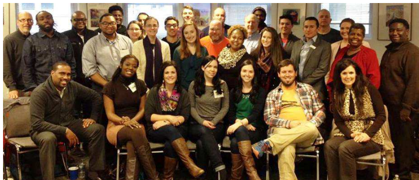
Healthy Masculinity Training Institute participants (including the four Nebraska advocates), January 2015, Washington, D.C.

www.mencanstoprape.org/healthy-masculinity-action-project .